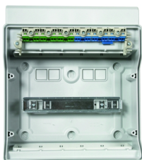
Integrated plug-in terminal technology for PE and N conductors.