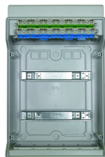
Integrated plug-in terminal technology for PE and N conductors.