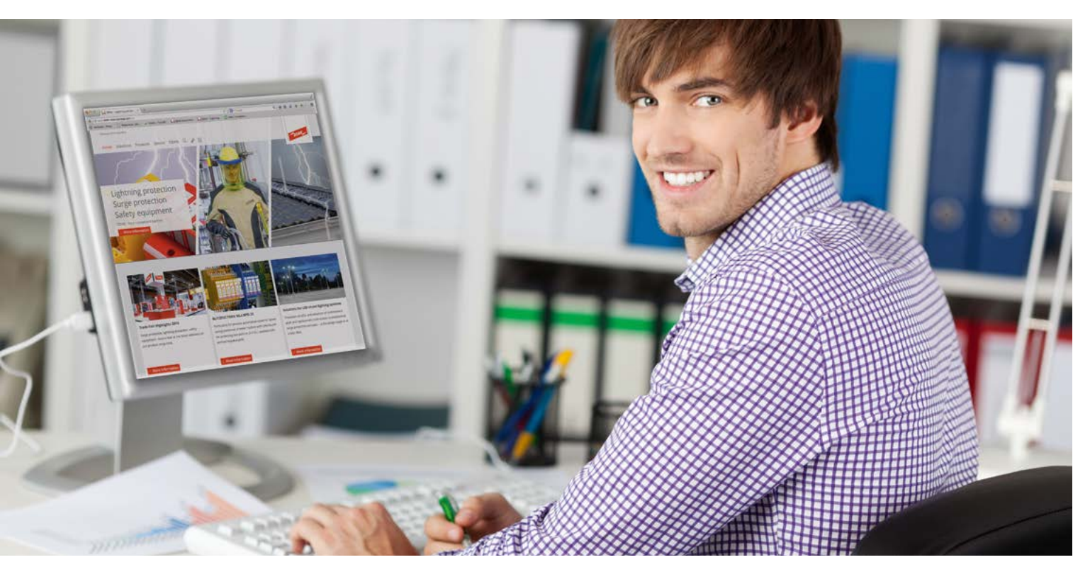
Be it by personal contact, mail or telephone: Our Technical Support provides professional consulting services in the fields of surge protection, lightning protection and safety equipment.

Our live working service allows our customers to save costs for training staff and providing personal protective equipment.