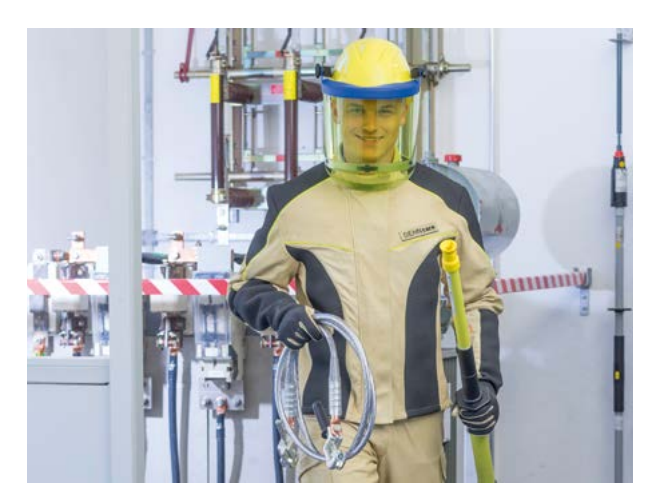
Our safety equipment portfolio includes safety devices, arc fault protection systems and personal protective equipment and ensures safe work on electrical installations.

Our comprehensive and worldwide unique portfolio makes us a leading solution provider in the above mentioned fields. A variety of national and international patents and awards demonstrates the continuing success of our activities and the quality of our products.