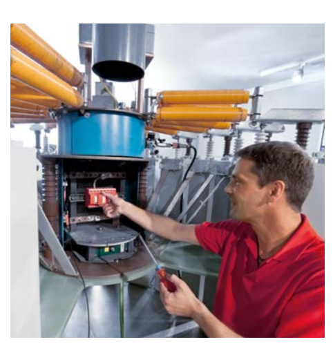
In our lightning current laboratory, we carry out product and system tests in line with international standards – also on behalf of our customers.