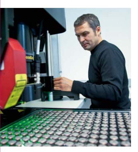
Numerous functional tests ensure the reliable quality of the materials used for our products and components.

We finance an endowed professorship at the Ilmenau University of Technology to promote fundamental research on modern methods, technologies and materials in the fields of lightning and surge protection.