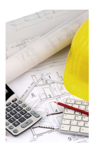
With the help of a 2D and 3D representation of planned lightning protection measures, it quickly becomes obvious how to integrate them in the building's architecture.