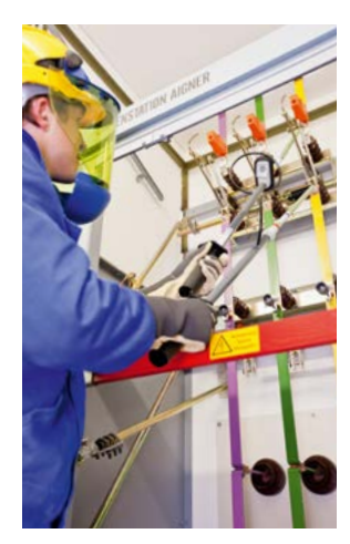
DEHN electricians perform live working as a service, competent and on schedule.